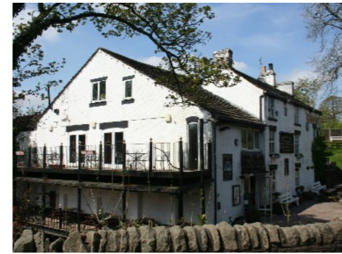
Little Mill Inn, Rowarth